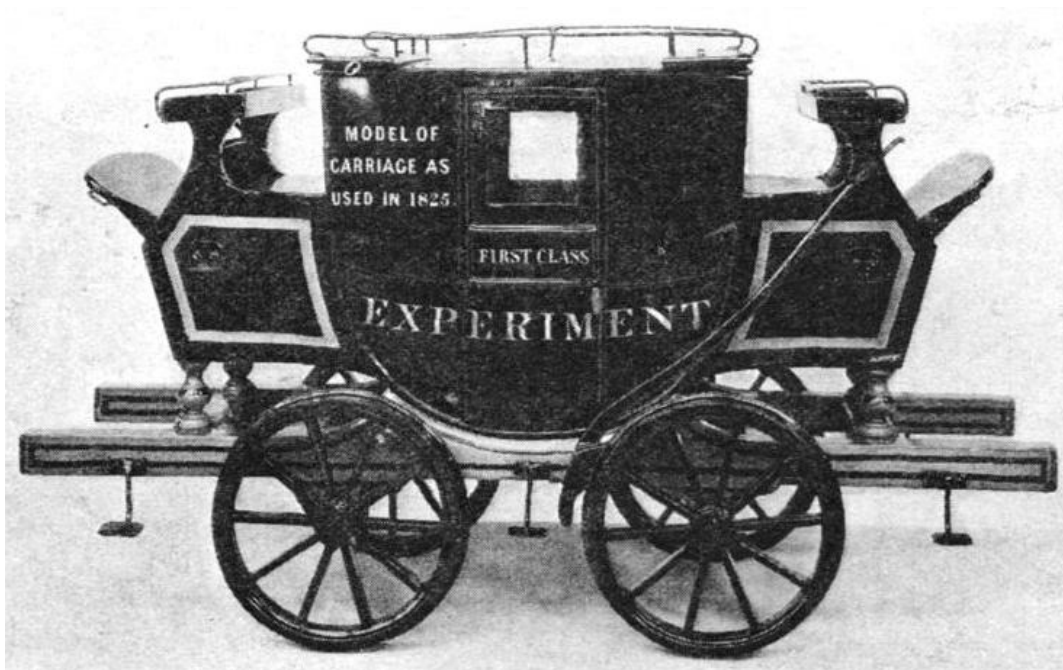
Fig 1: The “Experiment”, the first passenger railway carriage, came into service on the Darlington-Stockton line just a fortnight after the first passenger rail journey, in October 1825.

At the very outset, passenger accommodation on the railways was designed to mirror that of travel by stage-coach. Those who could afford a higher fare were carried inside, while those on the outside, who were forced to brave the elements, paid a lower rate 8 . Indeed, the very earliest railway carriages even looked like stage-coaches 9 .